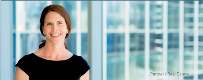
Partner / Real Estate

Skadden, Arps, Slate, Meagher & Flom LLP and Affiliates